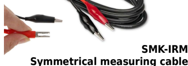
SMK-IRM Symmetrical measuring cable